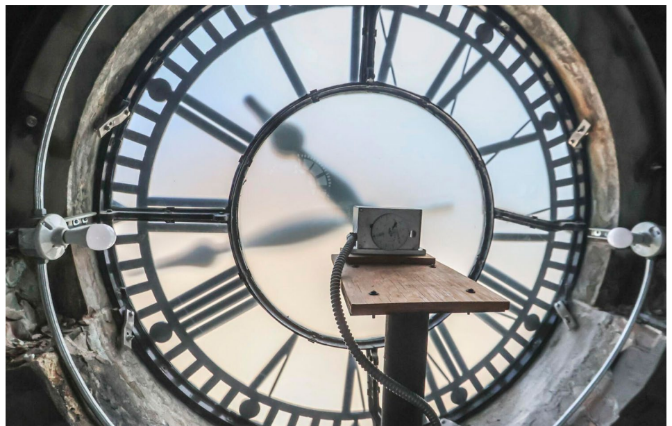
A view of the clock from inside the dome of the McLean County Museum of History (photo credit: Clay Jackson, The Pantagraph, published July 16, 2022).

But, just getting the clock working was not enough. In 2001, the dynamic duo of Bill and Don set off to make the bells work so